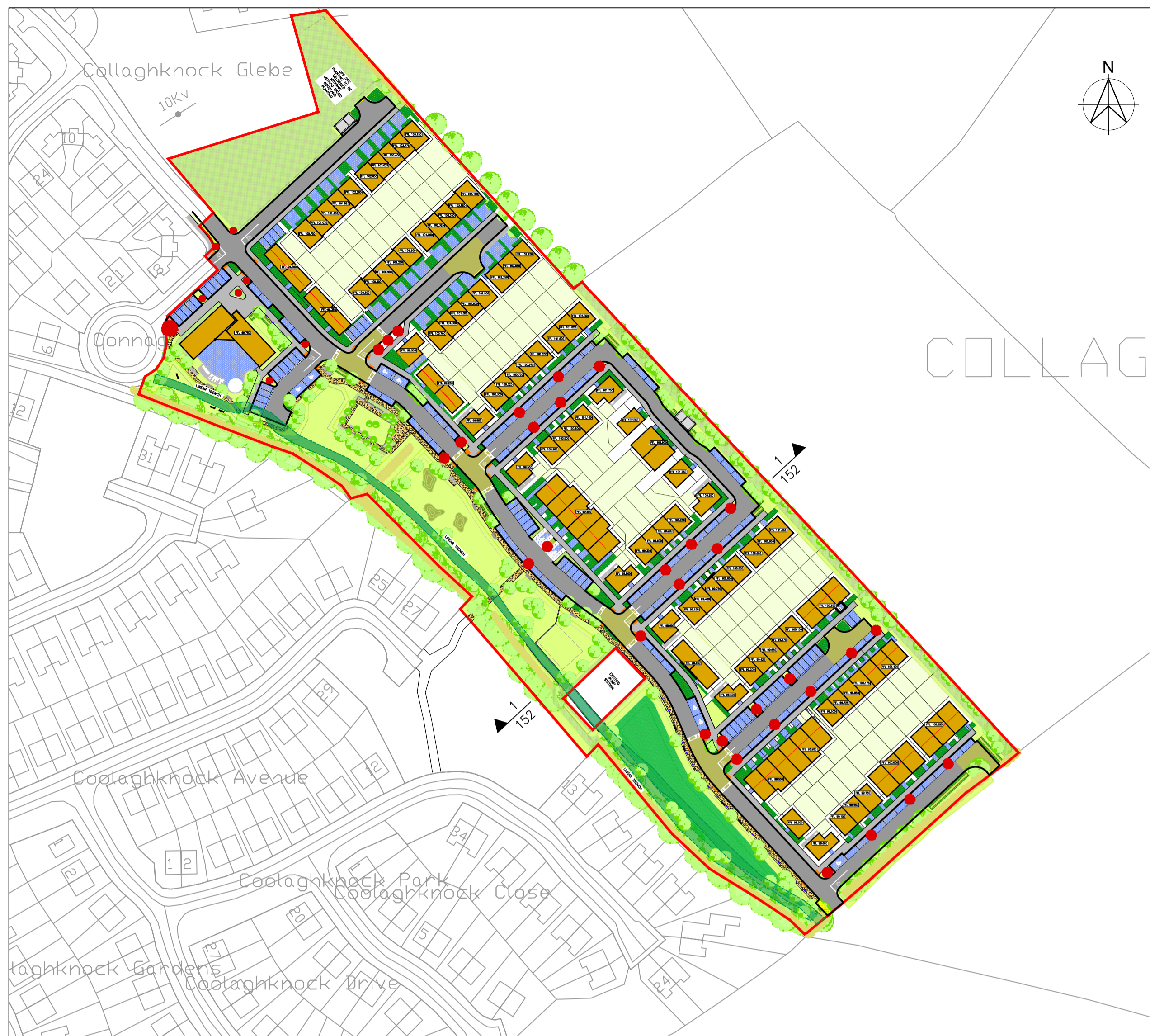
PLAN OF SITE SCALE N.T.S.